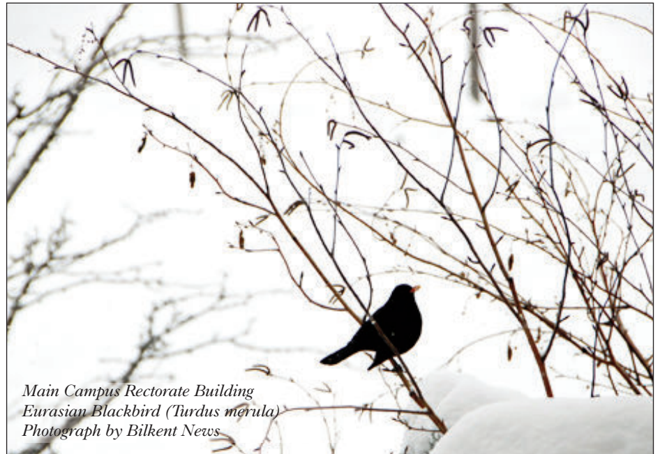
Main Campus Rectorate Building Eurasian Blackbird ( Turdus merula )