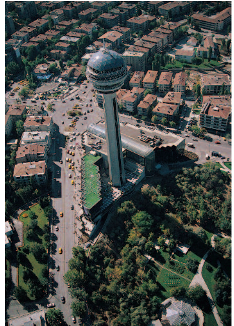
Atakule, Çankaya, Ankara