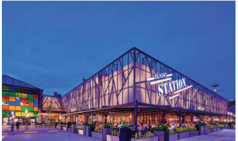
Bilkent Station, Bilkent, Ankara

Zafer Shopping Arcade (secondhand books, stationery, arts and crafts, etc.) Atatürk Boulevard – Kızılay