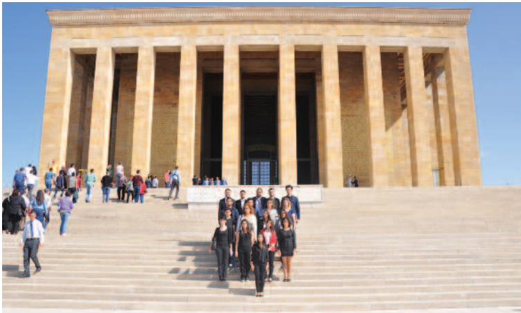
The Atatürk Mausoleum (Anıtkabir)