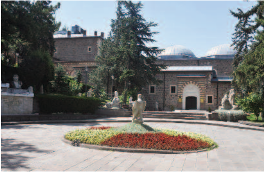
The Museum of Anatolian Civilizations (Anadolu Medeniyetleri Müzesi) Ulus, Ankara

http://www.rmk-museum.org.tr/ankara/hakkimizda/rahmi-m-koc-muzeleri