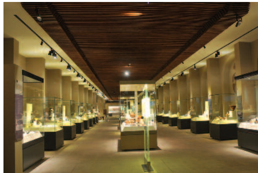
The Museum of Anatolian Civilizations (Anadolu Medeniyetleri Müzesi) Ulus, Ankara