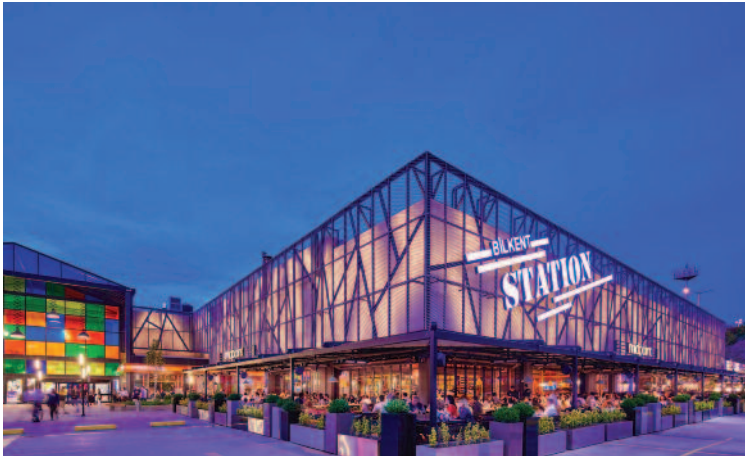
Bilkent Station, Bilkent, Ankara

Zafer Shopping Arcade (secondhand books, stationery, arts and crafts, etc.) Atatürk Boulevard – Kızılay