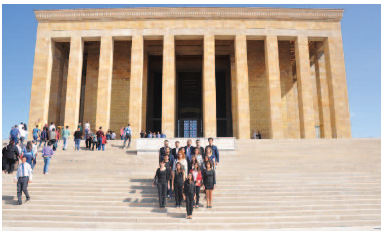
The Atatürk Mausoleum (Anıtkabir)