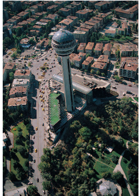
Atakule, Çankaya, Ankara