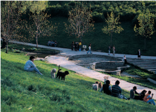
Seğmenler Park, Çankaya, Ankara

Atatürk Boulevard, Ankara's main thoroughfare, links Ulus with Kızılay, the heart of the modern city, with its many stores and lively nightlife and cafes. The street continues south to Çankaya, a district near the former Presidential Palace, where most of the embassies can be found.